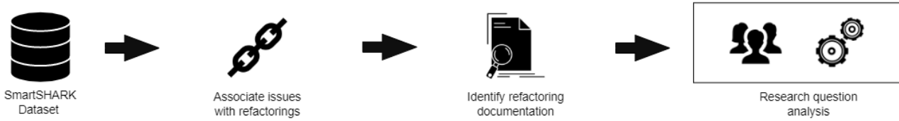
Figure 1: Overview of our experiment design.