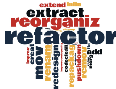
Figure 3: Popular refactoring textual patterns in issues.

To better understand the nature of refactoring documentation, we have classified the associated refactoring operations into 5 classes, namely, ‘changing’, ‘extracting’, ‘inlining’, ‘moving’, and